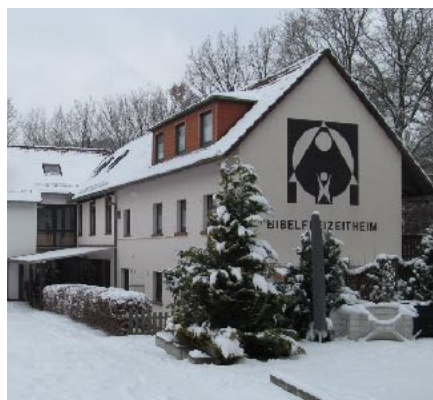
Where we should have been in February

Even though there was nothing like the same atmosphere and opportunities for interaction and excursions – to say nothing of opportunities to serve one another throughout the week – it was delightful to be together in a virtual fashion online, and to see so many familiar faces. A number of new faces were introduced to the event, so maybe next year, back at Gemünden, we might look forward to an even bigger reunion.