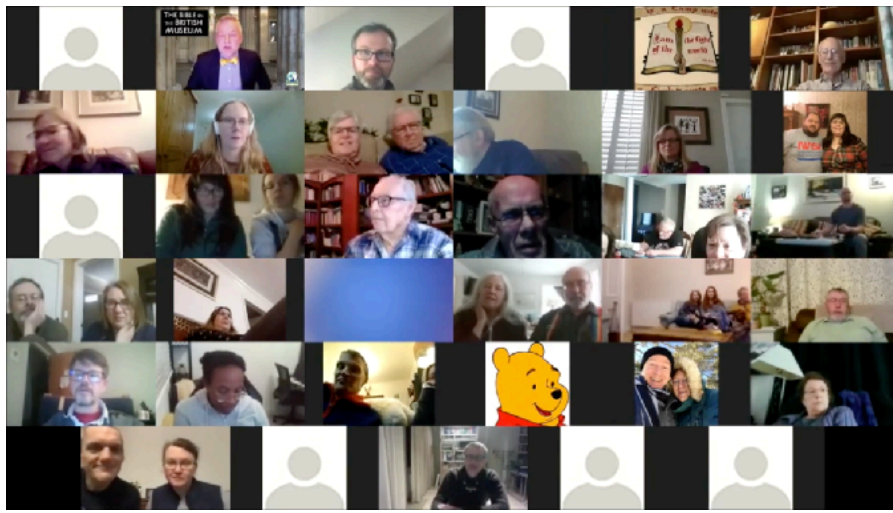
Some of those attending our first Evening Lecture Online in January

to rerun this event the following month.