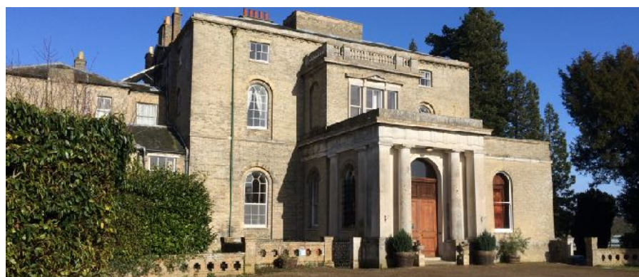
Letton Hall: the venue for our next Family Retreat from 14 th to 16 th September.

And yes, as we write, there are still some places available – but please get your bookings in as soon as possible. You can find details on our website.