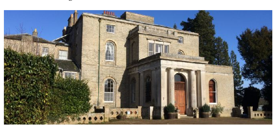
Letton Hall: the venue for our next Family Retreat from 14th to 16th September.

And yes, as we write, there are still some places available – but please get your bookings in as soon as possible. You can find details on our website.