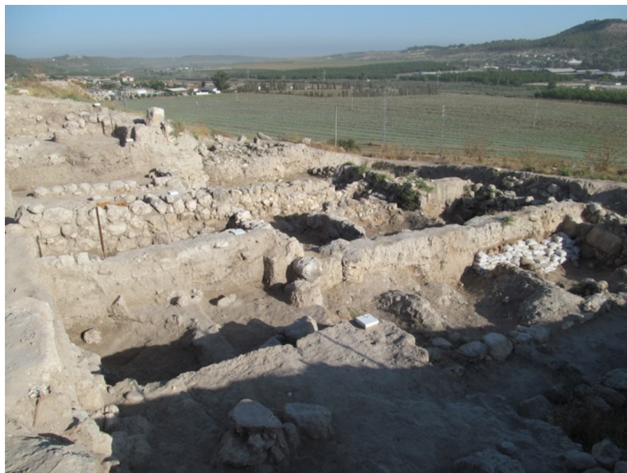
A view of the excavation site on Tel Beth-Shemesh, overlooking the Sorek Valley towards Philistine territory.